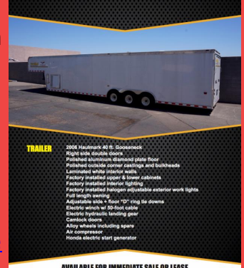
AVAILABLE FUR IMMEDIATE SALE UR LEASE FOR SALE Street car trades considered FOR LEASE with full transportation and track minimum provided by Haffakar Engineering 3-time Trans-Arm Charrysiens

Professionally built to represent the Tom Gloy Racing 2002 SCCA Trans-Am Winner.Commissioned by a gentleman racer who used it to dominate the competition in GT-1 racing.The entire package has been expertly maintained without regard to cost.A complete turnkey race team ready for you to run at the front in either SCCA or vintage racing. Click here for larger view. Call: 707.935.0533