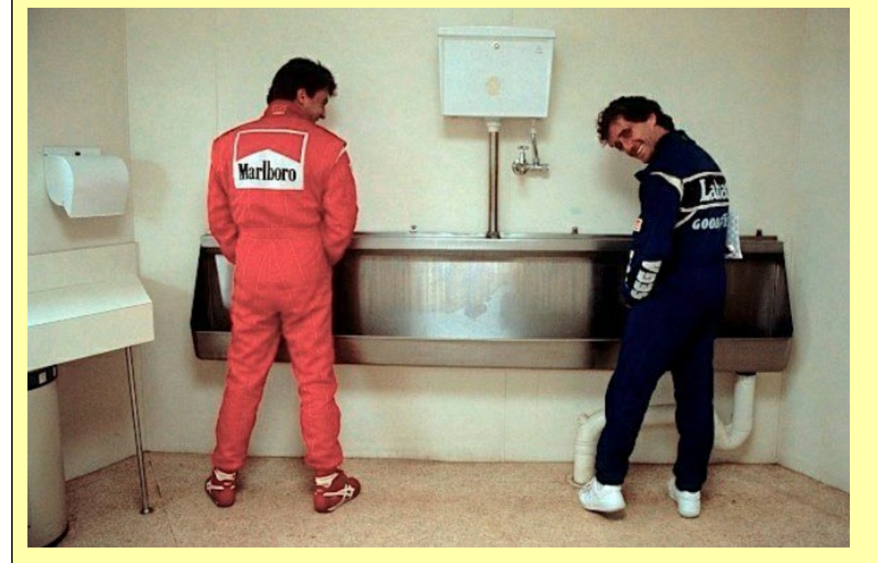
Don't Just Stand There Looking Stupid

were oversubscribed & were forced to turn down some entries. Point is, if you want to be assured of running, PLEASE get your entry in ASAP.