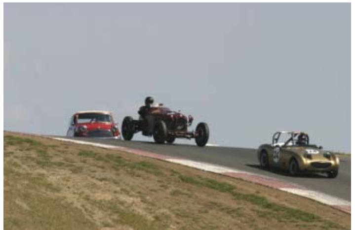
Alfa in a Mini-Sprite sandwich