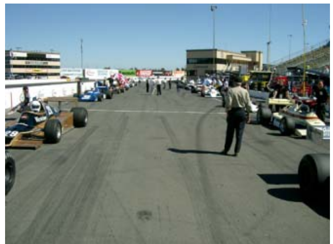
On the grid ready for the twelve lap main event