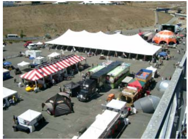
Paddock for HGP was the large white tent