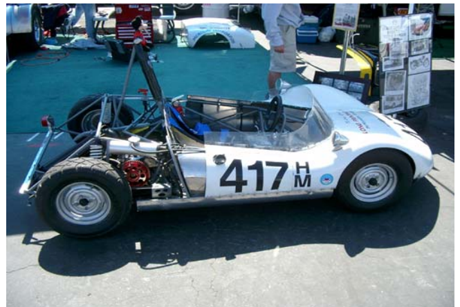
The Mercury Special - not much bigger than a kart.