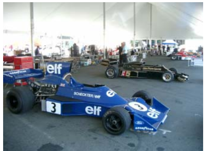
HGP under the big top