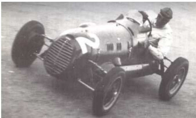
1947 1100cc Cisitalia