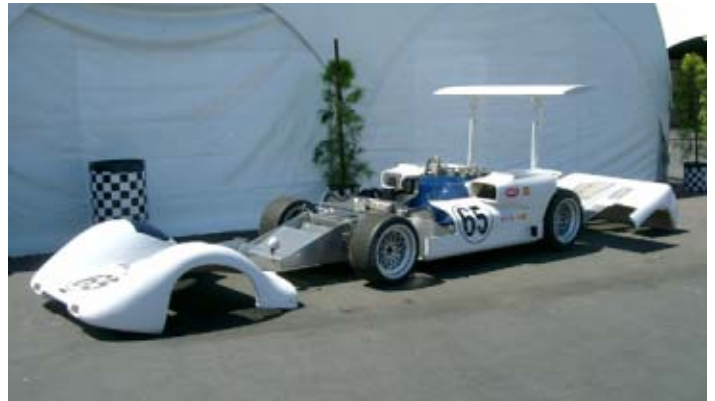
The Chaparral 2G sans body

This truly was a remarkable event, for cars that are not normally seen at vintage races were brought out for this special occasion. A Cunningham C2R and C4R; the Ingalls Special; Cannon Mk1; Shannon Crosley; H-Bomb; Byers Special and the Kellison Chevy were just a few of the many unique cars in the paddock.